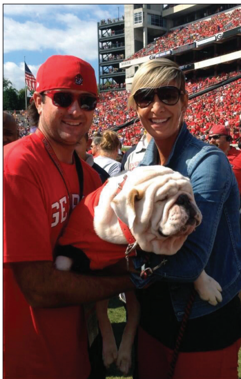
Uga is a lot heavier than you think!