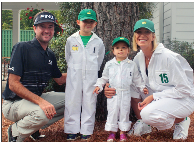
Getting ready for the Masters Tournament Par 3 Contest. One of our family's favorite traditions.