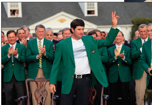
Celebrating my second Masters victory in 2014.