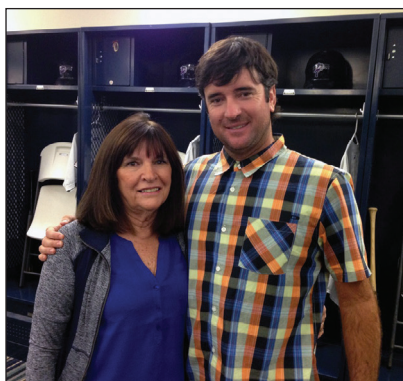
With my mom in the Wahoos locker room.