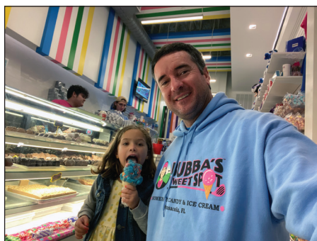
Dakota may love Bubba's Sweet Spot more than I do.