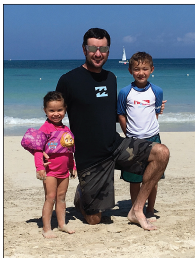
It's hard to beat a family day at Pensacola Beach.