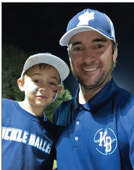
Nothing beats being a dad and helping out the team.