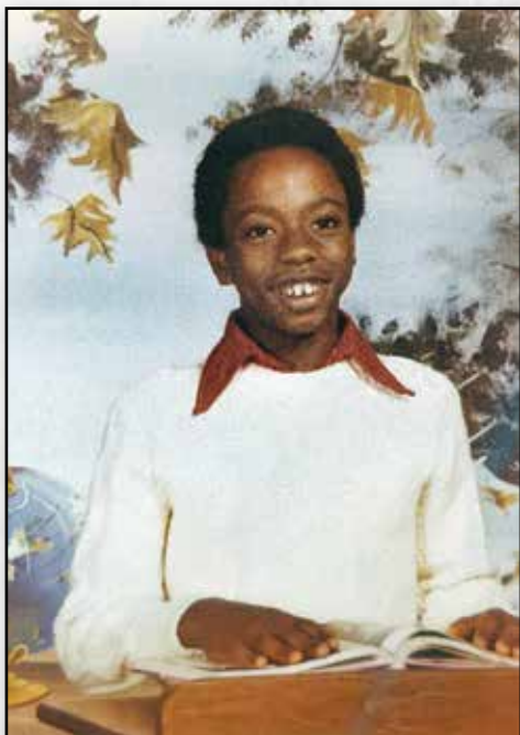
My official Midland Park Elementary School picture of 1975. I was ten years old.