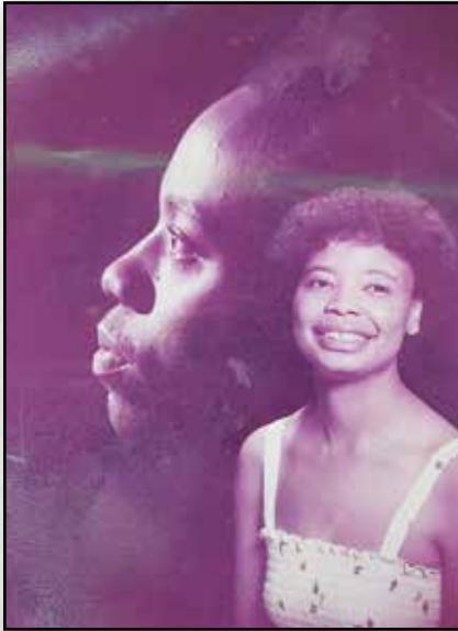
My mom in 1983; she was thirty-nine.