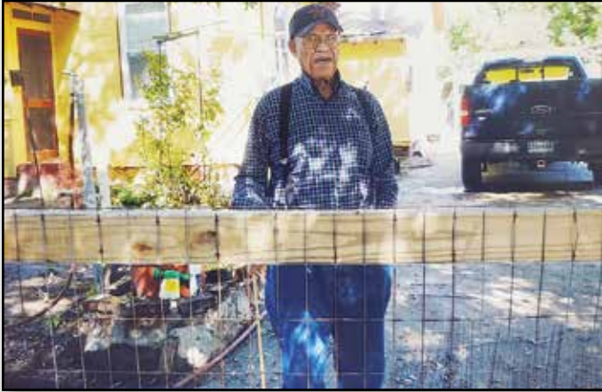
My granddaddy tending his garden in North Charleston. Gardening was one of his favorite past times.