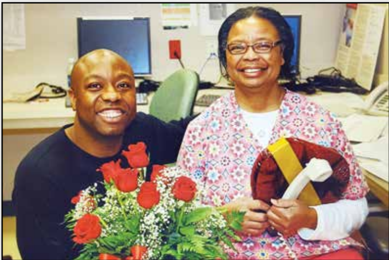
My mom and me at Bon Secours St. Francis Hospital where she has worked since 1973. This was taken in 2018 when I surprised her with flowers for Valentine's Day.